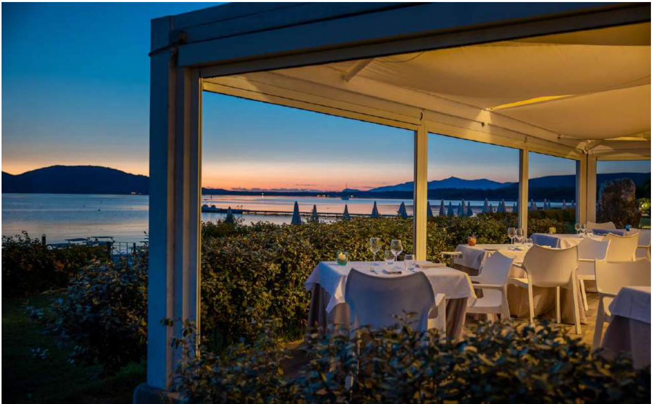
Hotel El Faro ****