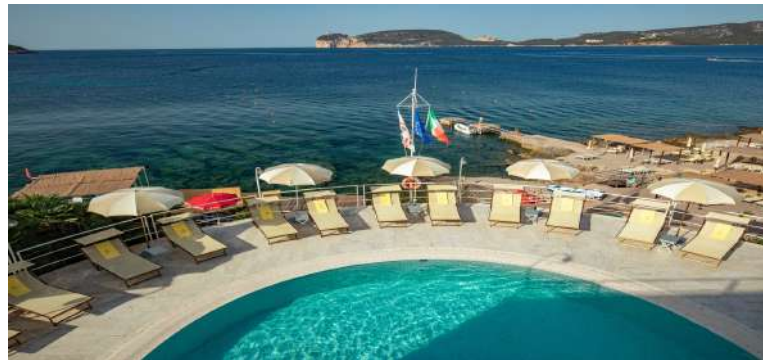
Hotel Arbatax Park Resort – Borgo Cala Moresca ****